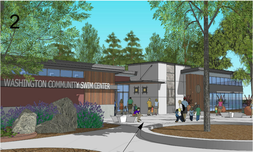
SPACE FOR PUBLIC ART INCORPORATED INTO PAVING AND WALKWAY AT PLAZA