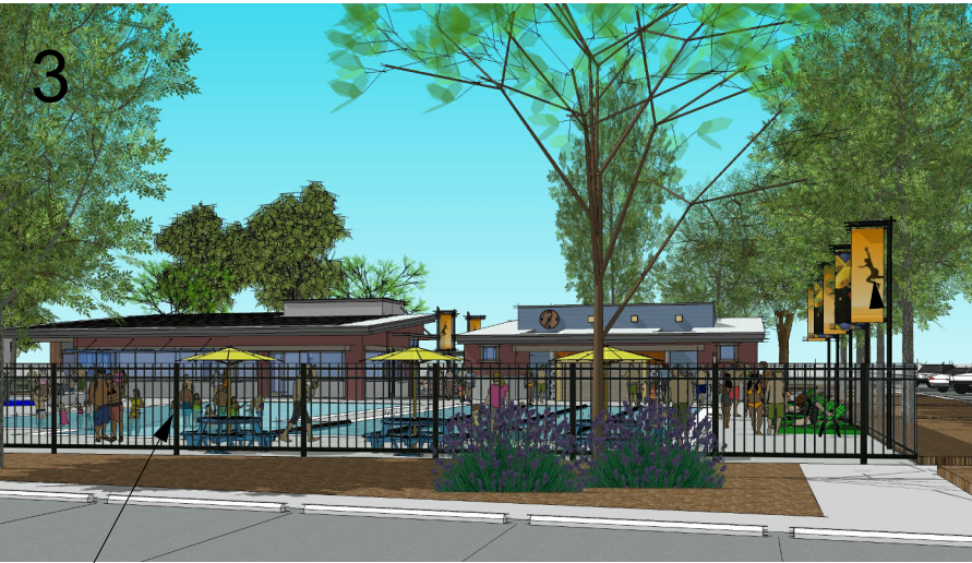
AREAS FOR PUBLIC ART AT FENCE