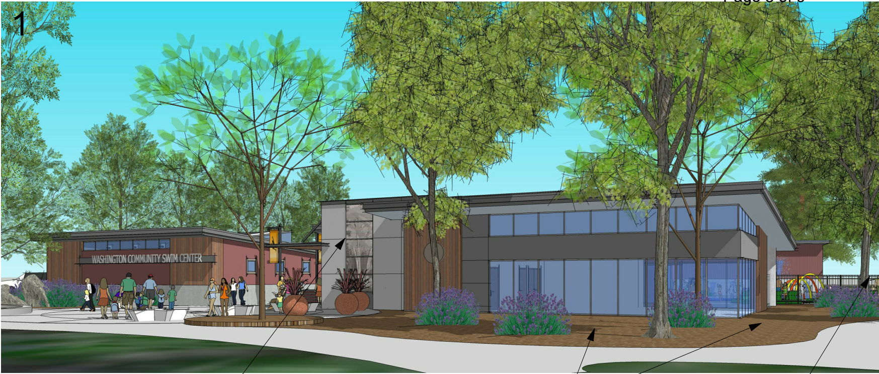
SPACE FOR PUBLIC ART INCORPORATED ON BUILDING AREAS FOR SCULPTURAL PUBLIC ART ADJACENT TO COMMUNITY ROOM AND ENTRY PLAZA SPACE FOR PUBLIC ART AT FENCE