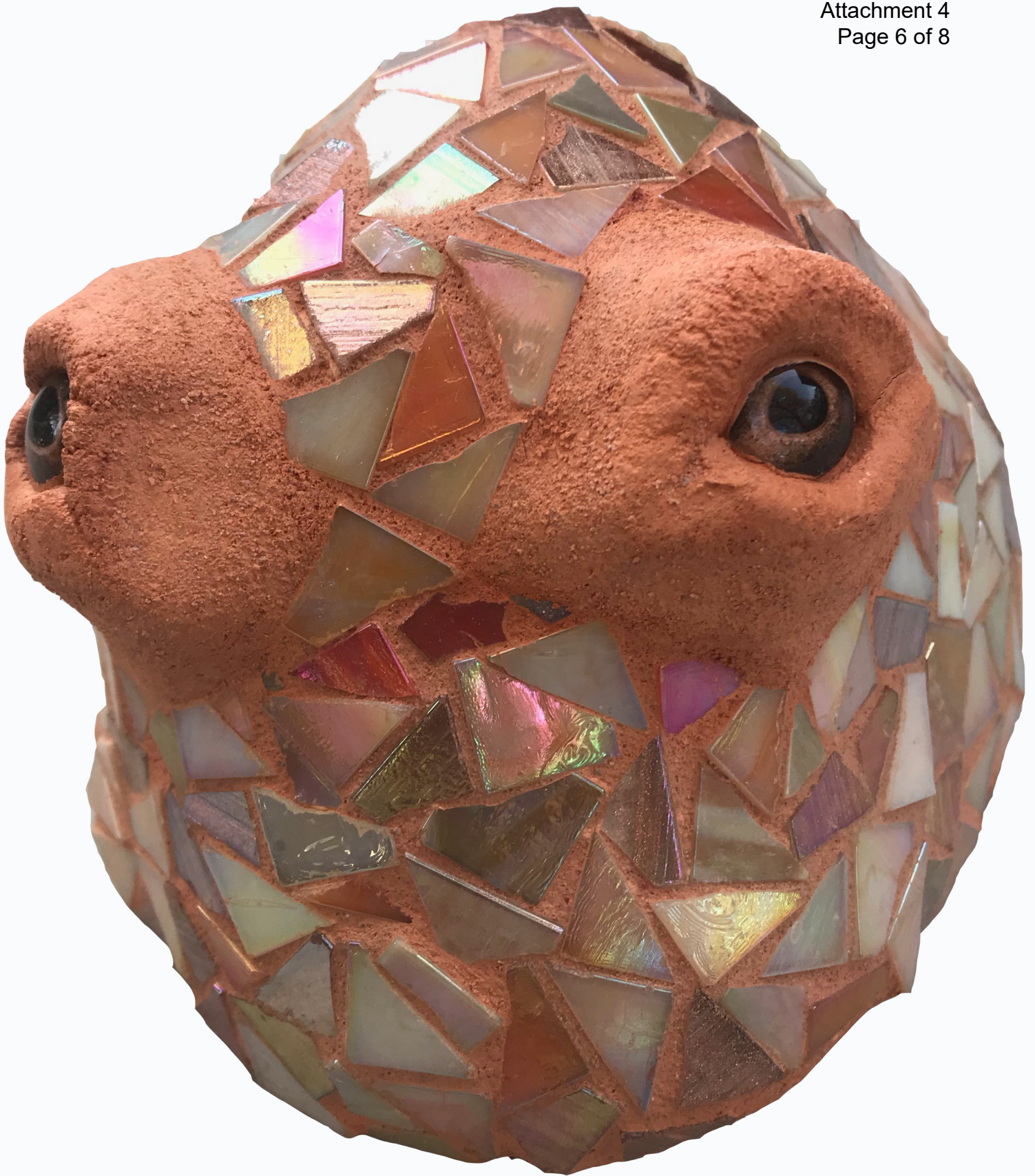
Octopus Mosaic Sample