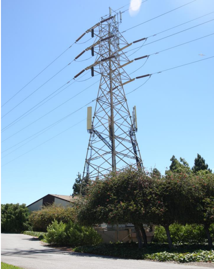
1082 Colorado St. Palo Alto