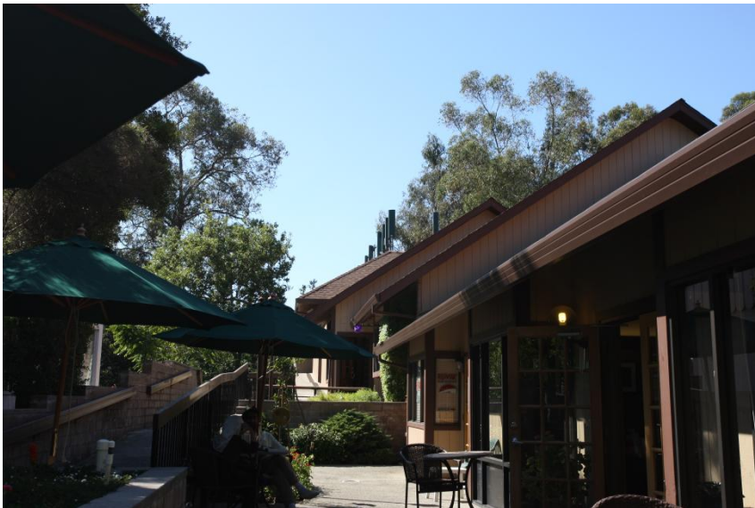
14407 Big Basin Way