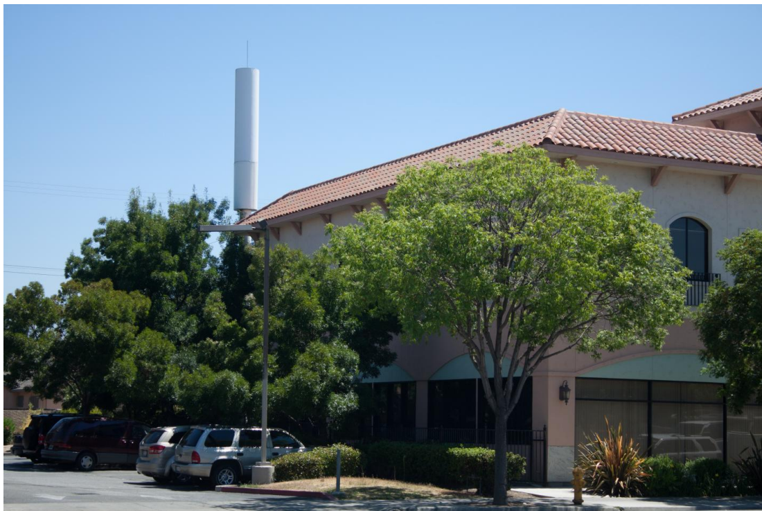
2110 Story Road, San Jose