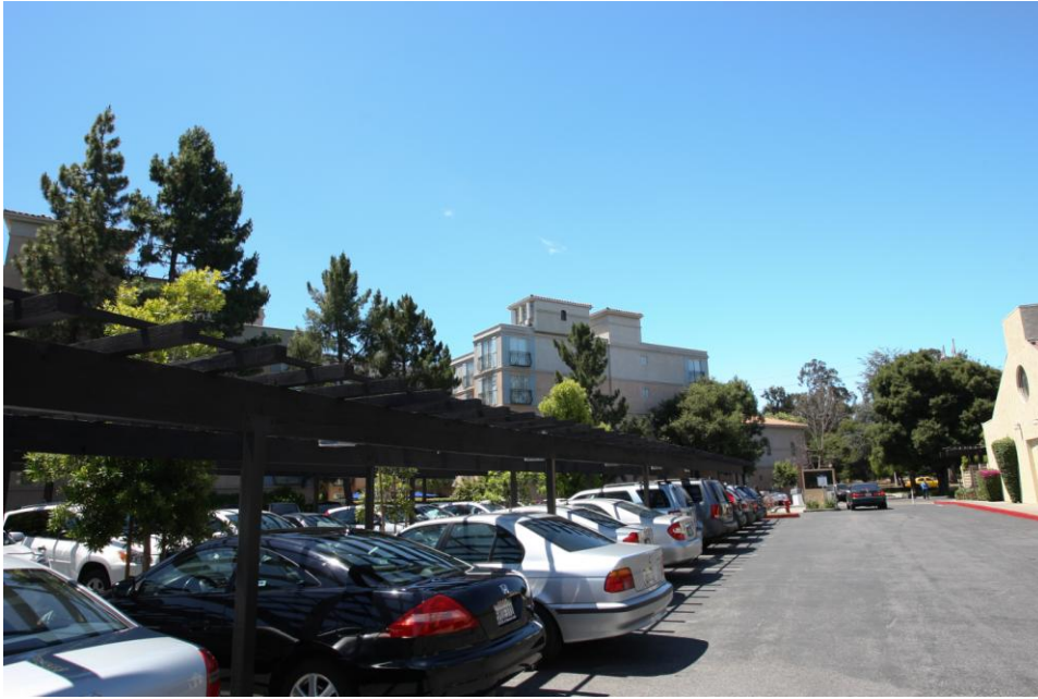
675 El Camino, Palo Alto