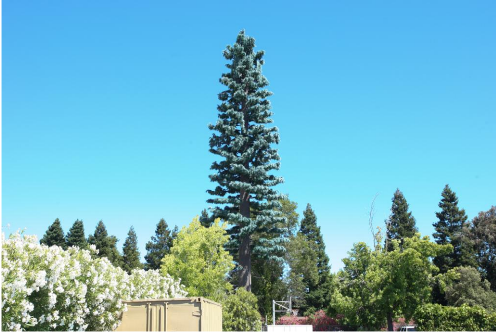
2575 Hanover, Palo Alto