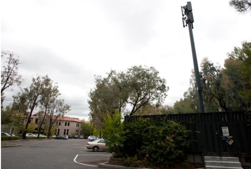
4009 Miranda, Palo Alto