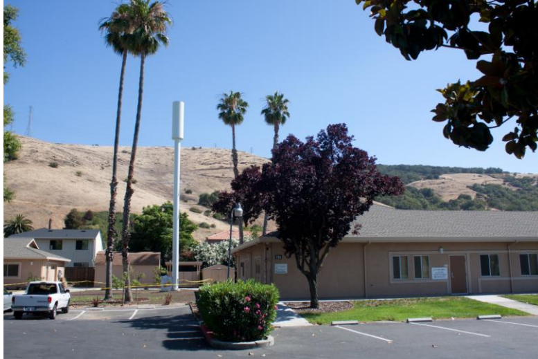
366 St. Julie Drive, San Jose