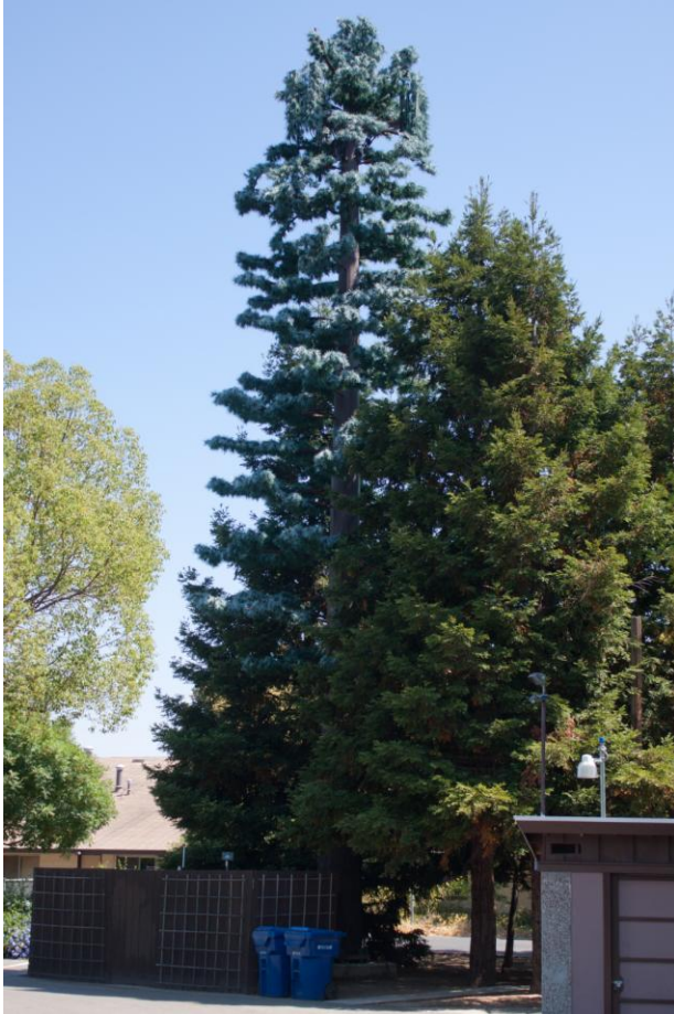
12770 Saratoga Ave, Saratoga