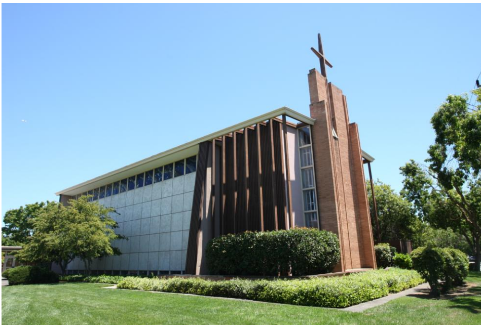
1985 Louis Road, Palo Alto