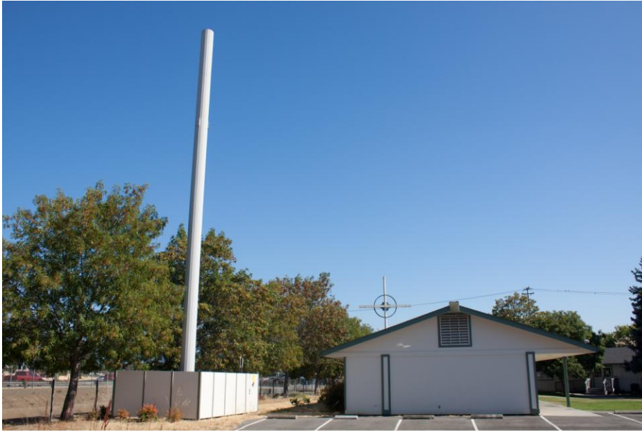
3675 Payne, San Jose