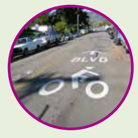
CLASS IIIB Bicycle Boulevard