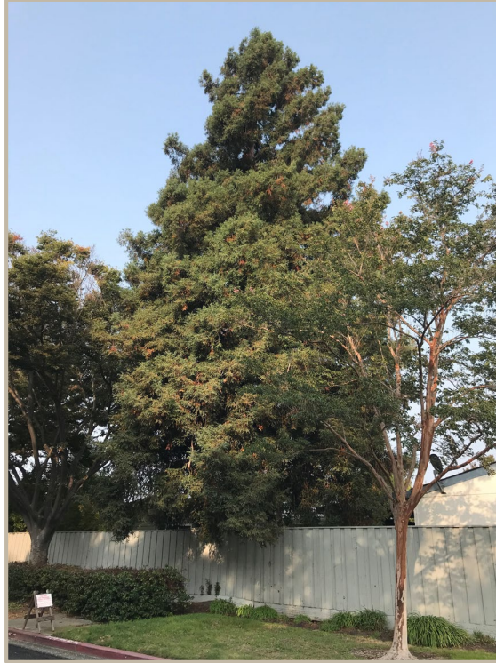
Rear of Unit 41