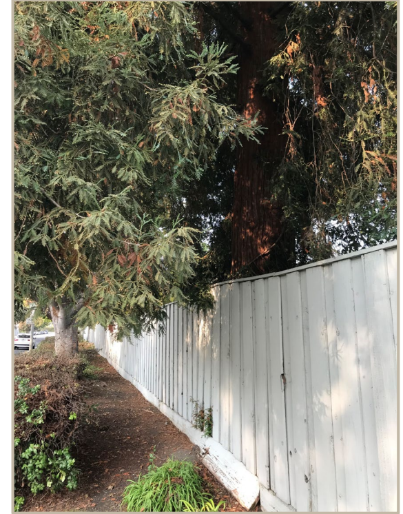
Fence adjacent to tree