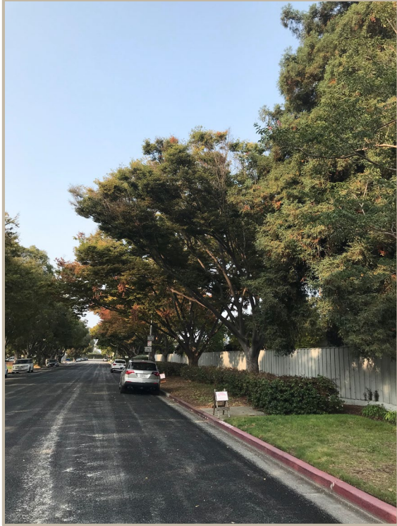
Redwood on Borregas Ave.