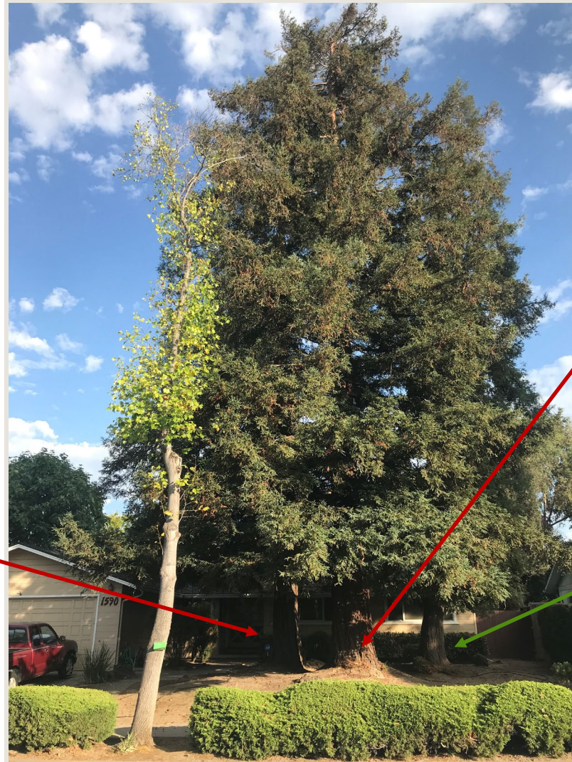
Redwood #1 Appealed