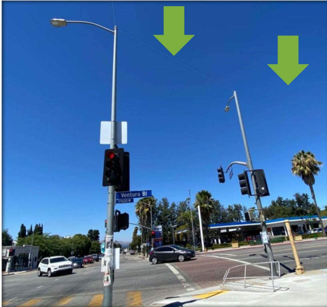
Example of Poly Monofilament Line installed on top of existing Streetlights