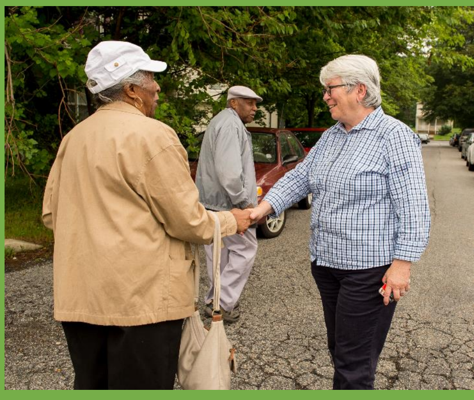
City Council Elections Redistricting Project Community Outreach Plan