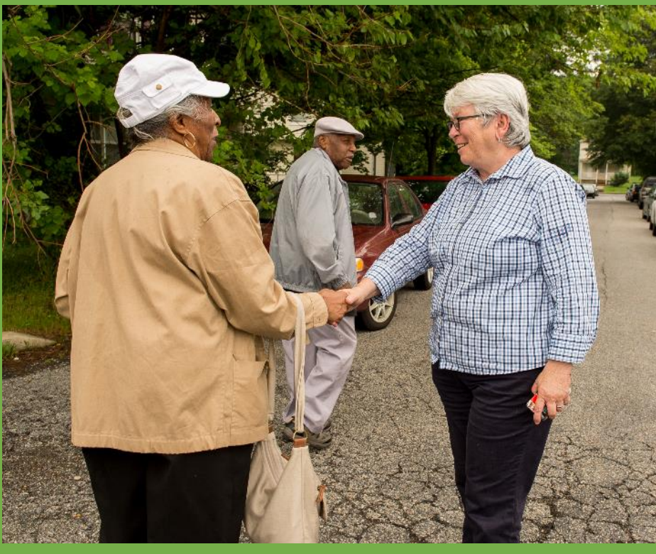
City Council Elections Redistricting Project Community Outreach Plan